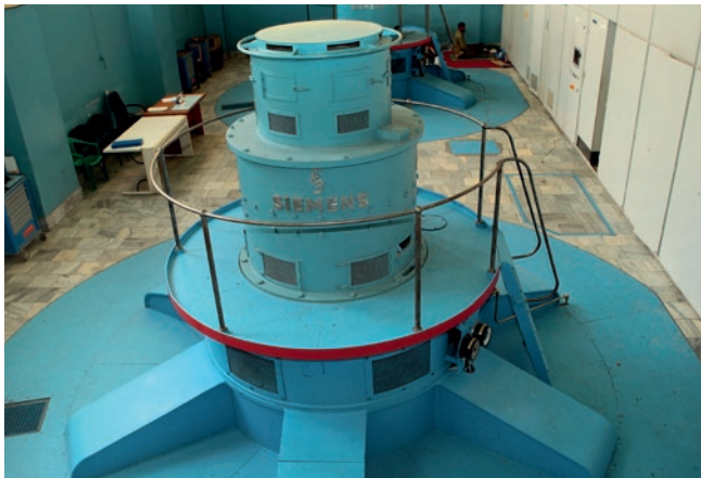
A new turbine in a hydro power plant utilises hydropower

The two rehabilitated hydropower plants now generate 302 gigawatt hours of energy, three times as much as in the past. This is providing power to 13,000 companies and 312,000 households, that is, just under two million people. In this way, the plants are improving the energy supply to the capital and its surrounding region.