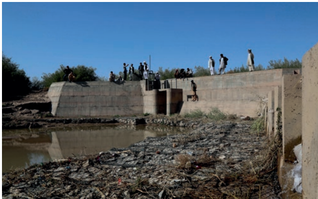
A new canal allows residents to irrigate their agricultural land

The ARTF finances running costs such as the salaries of civil servants, as well as specific national development programmes in the areas of rural development, agriculture, infrastructure, good governance, and social and human development.