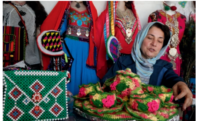
Women receive support to sell their handicrafts and thus have an income

One such example is the Education Quality Improvement Program (EQUIP), for which Germany provided annual financial support of EUR 20 million between 2011 and 2015. At the beginning of the programme, just 200,000 girls attended school in Afghanistan, compared to the current figure of some 3.4 million. And boys are attending school more regularly too, with the number rising from one million in 2002 to around 5.2 million at present. Teaching quality has also improved as a result of 600,000 teachers undergoing didactic and subject-specific training, trainee teachers completing school placements.