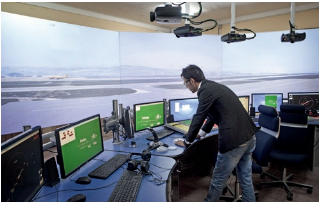
Modernised airspace surveillance

The air traffic control facilities and take-off and landing navigation system at Mazar-e Sharif's airport have been modernised. Additionally, KfW is supporting the Afghanistan Civil Aviation Authority (ACAA) with expanding its national air traffic control activities.