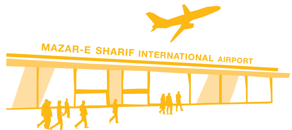
2013: opening of the expanded airport

With financial contribution from the Abu Dhabi Fund, the German government assisted the Afghan government in expanding the airport in Mazar-e Sharif in line with international standards. In the long term, the airport is set to decisively improve economic development in the region as an international transport hub between Europe and Asia.