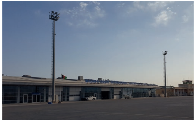
Mazar-e Sharif International Airport

Overall, the new international airport will deliver a great deal of positive impetus for the economic development of Afghanistan's Northern regions. Over four million people in the airport's catchment area potentially stand to benefit from the expansion. There has already been some visible progress. Companies are settling in the area and creating new employment opportunities. The construction phase alone saw 450 people employed at the airport, over two thirds of them from the region. This promotes development in the city of Mazar-e Sharif and strengthens the region as a whole. It is now also possible to transport patients to Kabul or abroad.