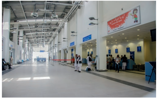
Mazar-e Sharif International Airport's new check-in hall