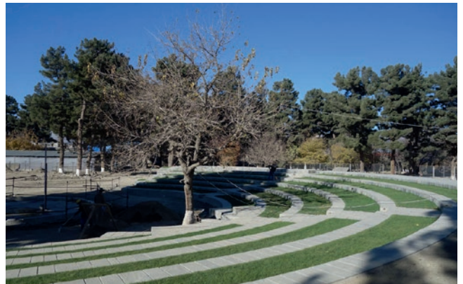
Chihilsiton Park's new amphitheatre