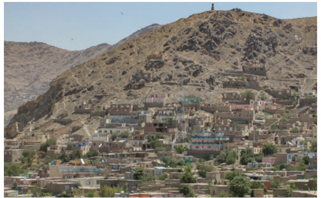
The neighbouring Char Deh district was taken into account throughout planning the park

In order to improve employment prospects for Char Deh's residents, the project has provided six-month training programmes in tailoring, embroidery, carpet weaving, joinery and gardening/landscaping to over 150 women and 100 men since 2015. At the end of this training, participants were supplied with the equipment needed to pursue their profession.