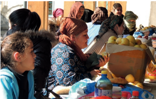
Women selling their products at markets promoted by PATRIP

One project is facilitating the construction of an outdoor area at the cross-border Vanj Market on the Afghan-Tajik border (Badakhshan province in Afghanistan, Gorno Badakhshan province in Tajikistan). This market is already very popular