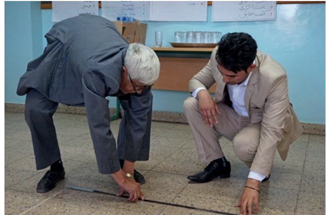
Teachers at the three model schools in Kabul learn new teaching methods

One of the most important factors for the success of any school is highly motivated and well-qualified teaching staff. To date, international trainers have provided advanced training for 240 teachers, focusing on teaching methods and non-violent education. A total of 22 teachers have already improved their knowledge of mathematics, and 50 teachers have attended training in natural sciences (chemistry and biology). Other training courses, e.g. in modern foreign languages, will follow. English will in future be the first modern foreign language to form part of the three schools' curriculum.